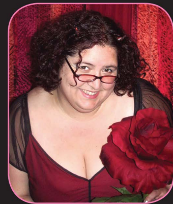
CHERRY MIDNIGHT COLLECTOR CARD