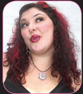
LADY VENUS COLLECTOR CARD